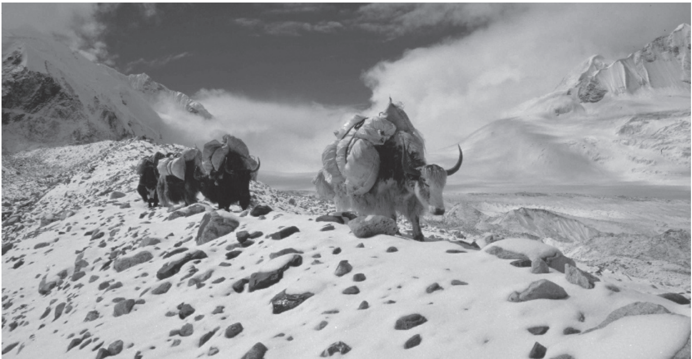
Yak train descending, Cho Oyu