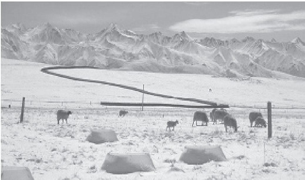
Experiment site under snow

There are two main habitats in the region: winter-grazed meadow situated along the valley floor, and summer-grazed shrubland situated on the higher slopes encircling