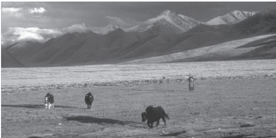
Rangeland with yaks on the Tibetan Plateau