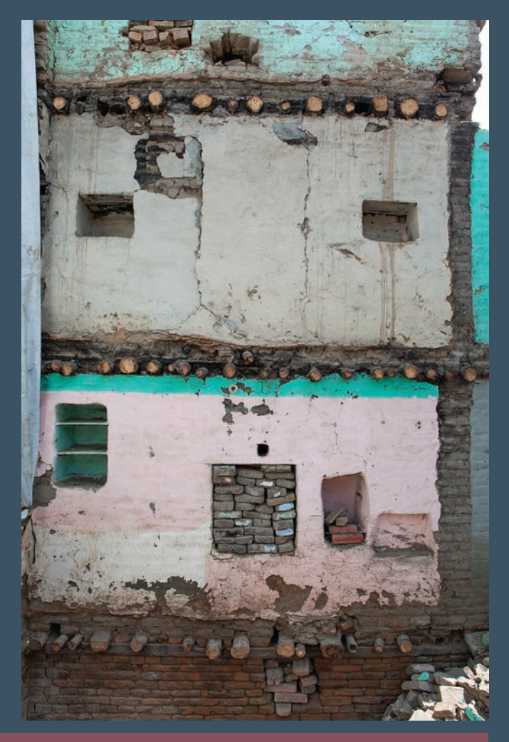
In a neighborhood on the east side of Bhaktapur, interior walls of family houses were exposed by the collapse of roofs and neighboring buildings.