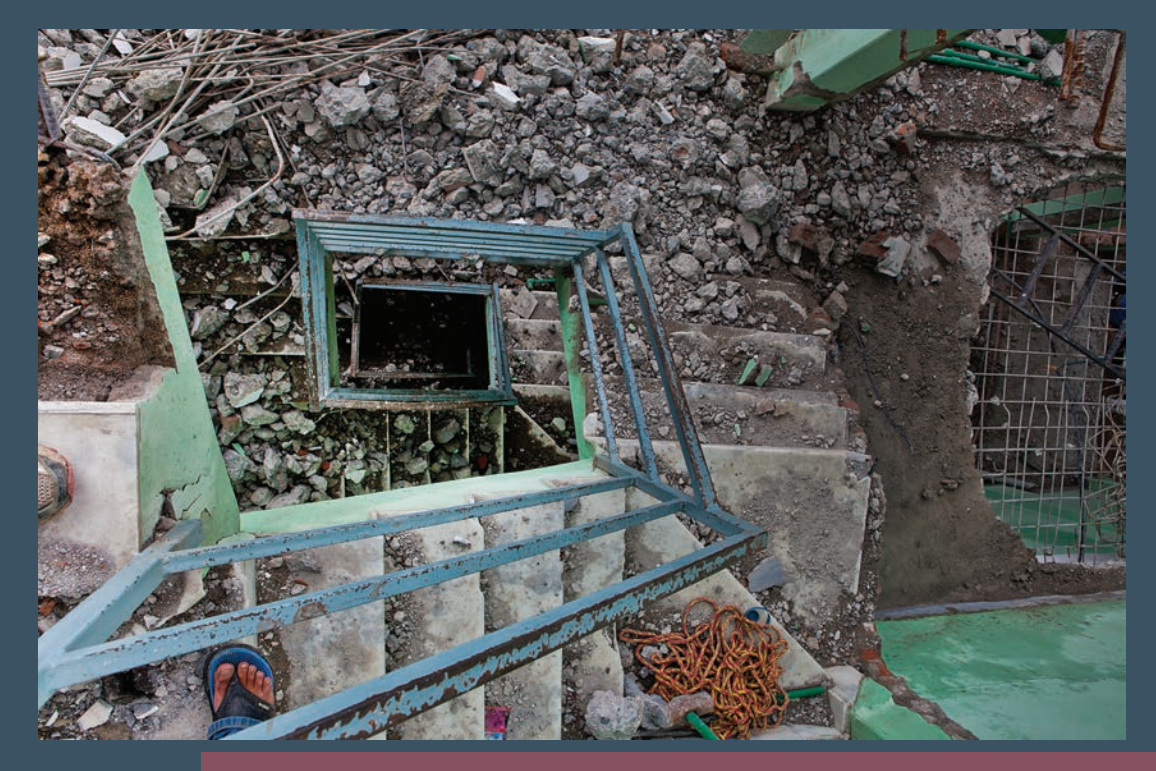
The fourth-floor stairway of a building under demolition is covered in rubble. Such stairways became internal chutes for rubble to be brought down to ground level. Workers made holes by pick axing and hammering through concrete and rebar floors in order to let rubble fall down to the lower levels. This way, the demolition laborers did not have to carry heavy loads of debris down the stairs.

In the Chyasal neighborhood of Patan, Buddhist stone shrines, called caitya , and prayer wheels were damaged by falling brick and debris from the surrounding houses. This section of old Patan was damaged more severely than other neighborhoods.