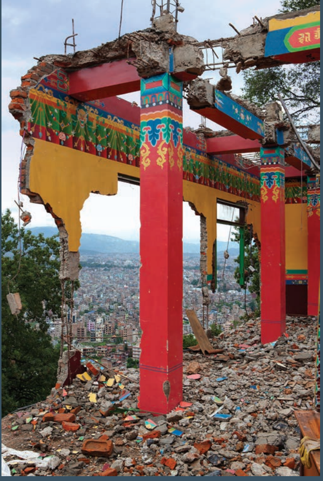
By mid-June 2015 there was little left of the Karma Raja Maha Vihara monastery on the Swayambunath hill, west of downtown Kathmandu. The monastery was badly cracked and was taken down under the supervision of UNESCO and the Karmapa ShaMarNag Committee.