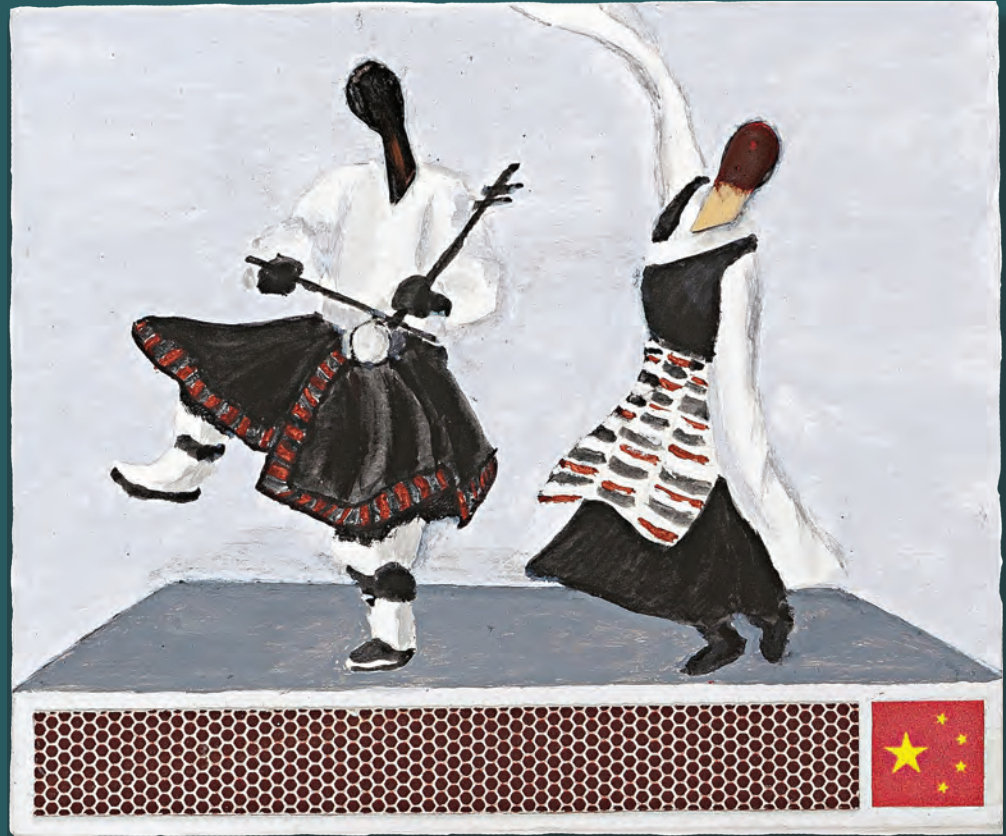
Tsering Gyatso Chuteng, Black Dance , watercolor on canvas, 10x12cm, 2013. Used by Permission of Imago Mundi (Luciano Benetton Collection) and published in the catalog Tibet: Made by Tibetans , 2015.