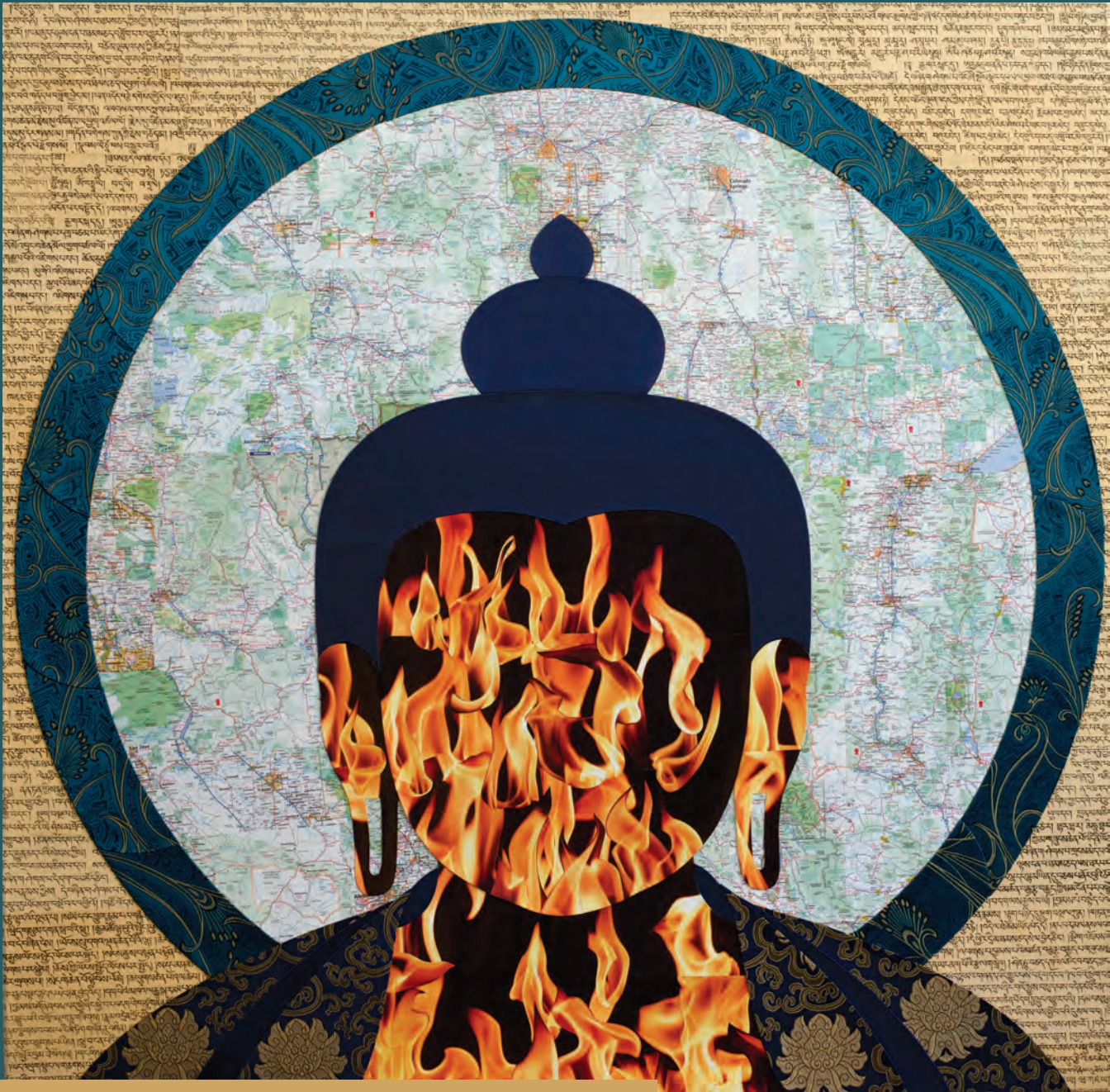
Tenzing Rigdol. Wrathful Dance, silk brocade, collage, 91 x 91 cm, 2014.

Used by permission of Trace Foundation, and published in the catalog accompanying the exhibition "Transcending Tibet," March 14-April 12, 2015, New York.