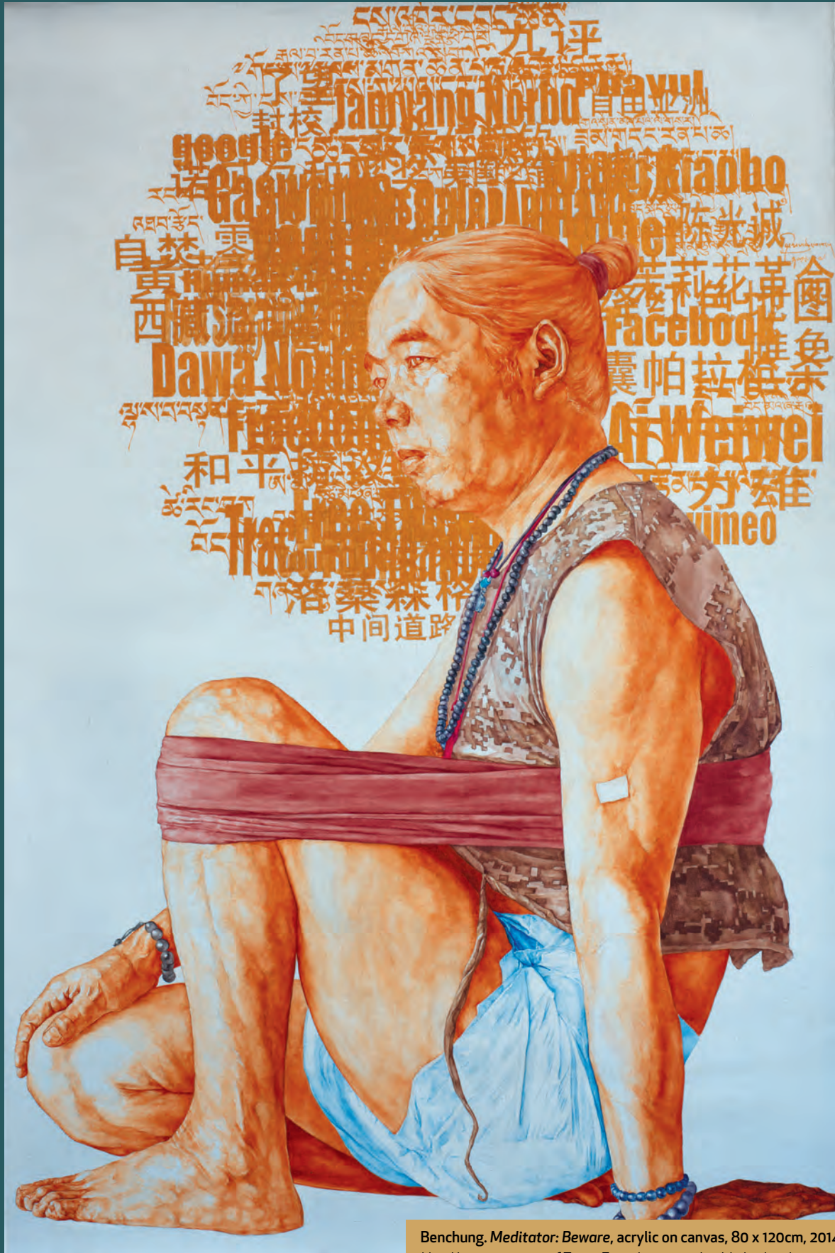
Benchung, Meditator: Beware , acrylic on canvas, 80 x 120cm, 2014.

Used by permission of Trace Foundation, and published in the catalog accompanying the exhibition "Transcending Tibet," March 14-April 12, 2015, New York.