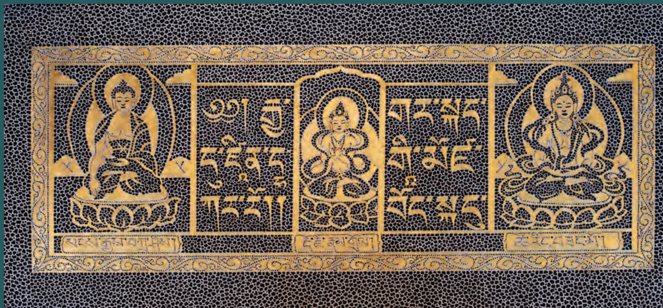
Jamyang Tulku. Foodism (one of a two part work). Painted incense-burned rice paper over cardboard. 97 x 49 cm, 2014.

One finds, of course, a full range of human emotions and experiences in the current contemporary Tibetan art movement. However, political change in Tibet since 2008, including protests and self-immolations, has led to a decline in playfulness, humor, and juxtapositions of the more mundane ironies of globalization. Discrimination, surveillance, and curtailed religious and civic expression yield artistic expression of internal and collective states of anxiety, loss, alienation, and despair. Palpable tensions intersect—between cultural identity and commoditization, spiritual aspiration and fear, sustenance and ephemera. These windows into Tibetan realities reveal both transparent and veiled subjectivities, but this art asserts – through roots in Buddhist tradition, personal memory, and innovation – visions of cultural sustainability and the cherishing of a Tibetan future.