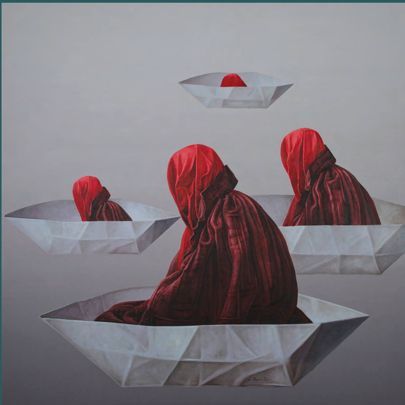
Nortse. Dreams in Paper Boats , mixed media. 135 x 135 cm, 2015.