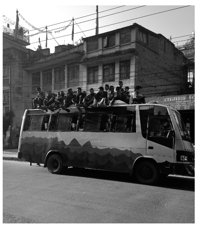
Commuters traveling along the Jorpati Road, Kathmandu, October 2015.

1. Rato Machhendranath is a deity in Buddhist and Hindu traditions, and is a cornerstone of Newari ritual life in the Kathmandu Valley. Each year the statue of Rato Machhendranath is taken between a temple in Patan and the deity's 'birthplace' of Bungamati village. In 2015, the April 25 earthquake interrupted the movement of this deity, celebrated in part to honor the rain gods at the start of monsoon. The deity completed its journey this year in late September.