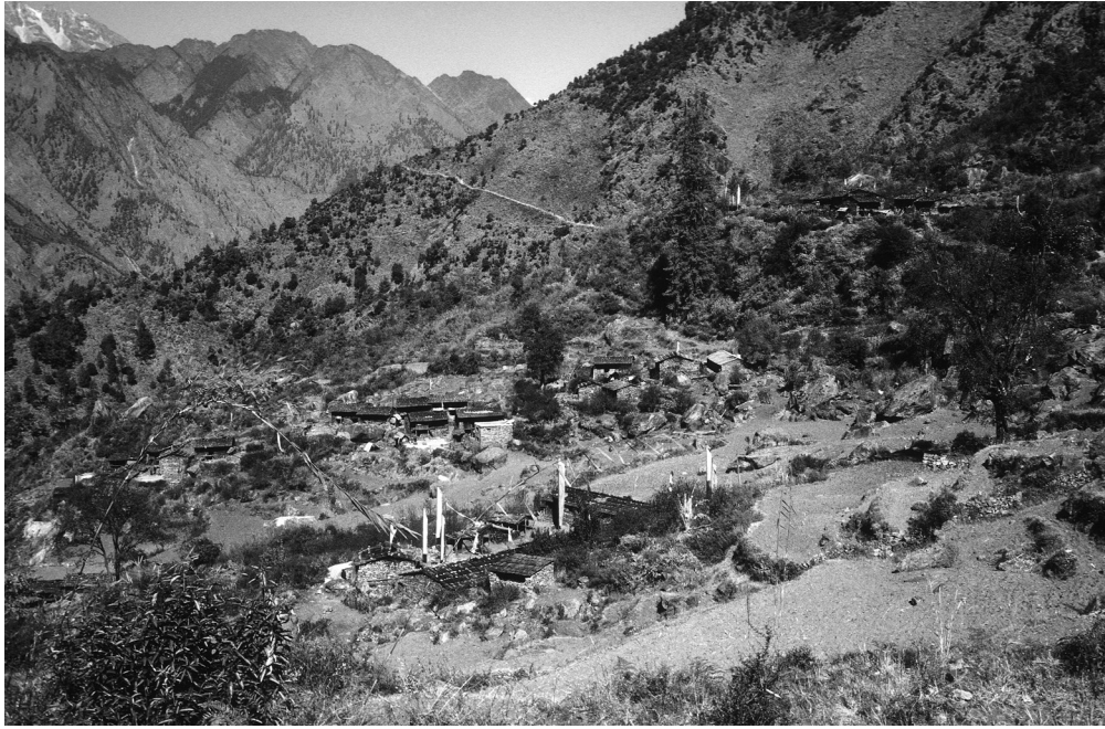
Figure 2. Briddim in 1984.