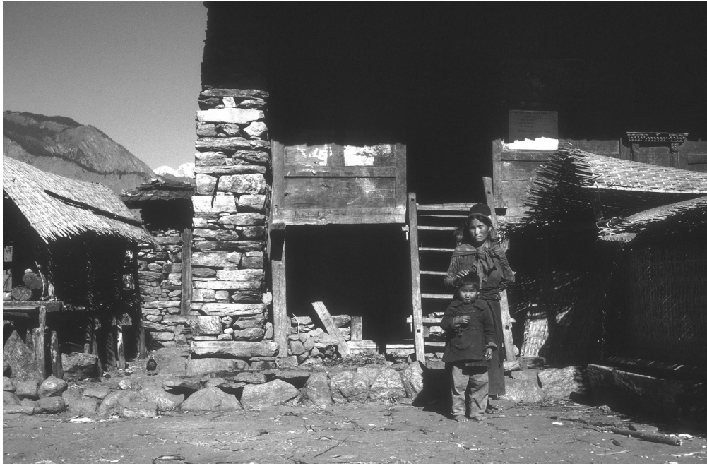
Figure 3. Geoff's hostess in 1984.