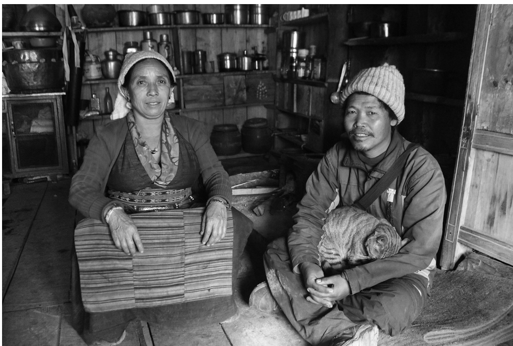
Figure 4. The couple who owns the house where Alyssa watched the WWE video. They have one child studying in Kathmandu, and another working in a salon in Kuwait.

Briddim is positioned on the Tamang Heritage Trail, an eight-day, culturally-focused trekking trail designed and implemented by the Tourism for Rural Poverty Alleviation Program (TRPAP). 12 Briddim is the only village along the trail primarily promoting homestays, as other trails have a focus on a community lodge, hot springs, and scenic viewpoints. Homestay tourism is a newly emerging model in Nepal which involves a locally run and managed operation where tourists reside in the homes of community members. This model of homestay tourism provides those with a low socioeconomic status, women in particular, greater opportunities to assume more conspicuous marketplace roles as well as make economic and social gains (Acharya and Halpenny 2013). The TRPAP supplied funding for infrastructure, tourism management training, and provided small loans to households to develop their