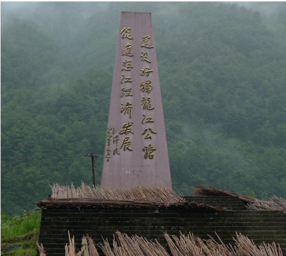
Figure 2. Memorial in honor of the road, Kongdang village, 2010. The memorial reads: "Building the road to the Dulong River, promoting the economic development of Nujiang." Jiang Zemin, 1 May 1999.