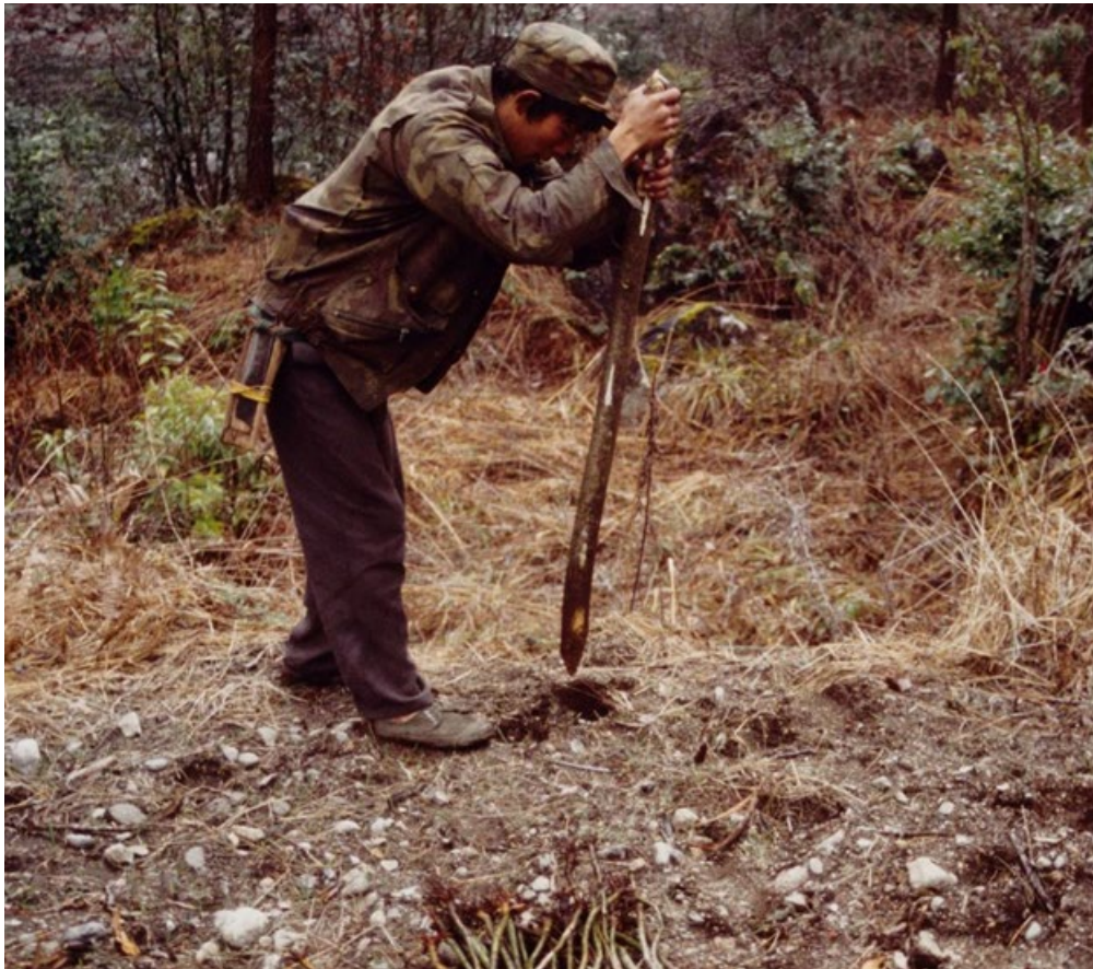
Figure 4. Planting of alder saplings, Dizhengdang village, Northern Dulong Valley.