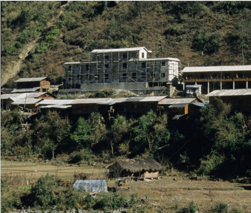
Figure 1. One of the first multi-story buildings in the Dulong Valley, Kongdang village, County seat.