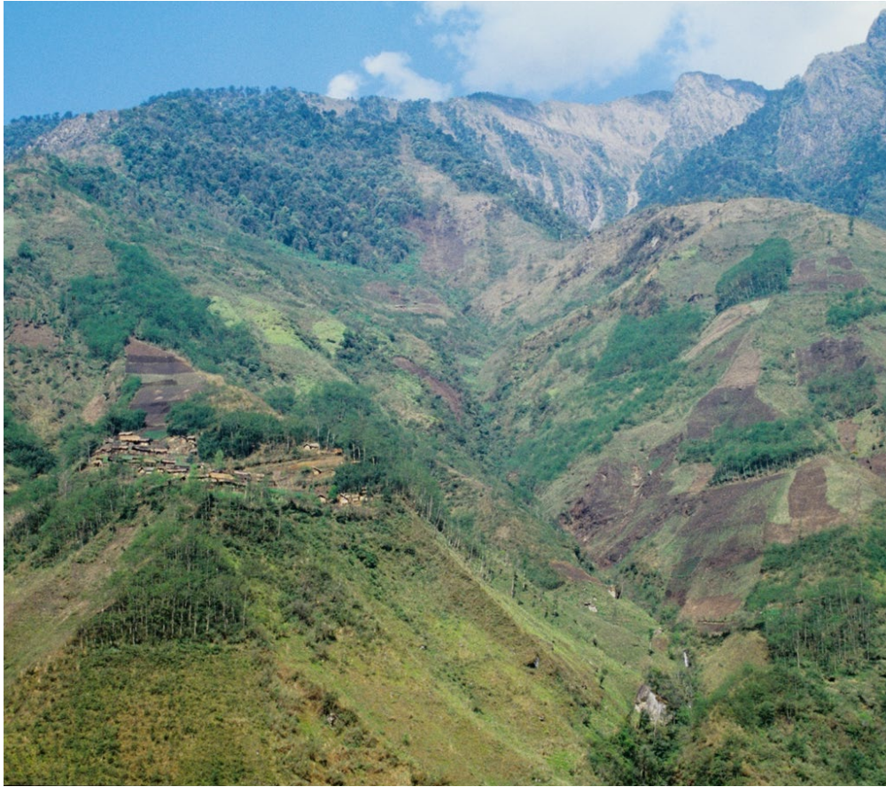
Figure 3. Patchwork of alder fields on mountain slopes, central Dulong Valley.