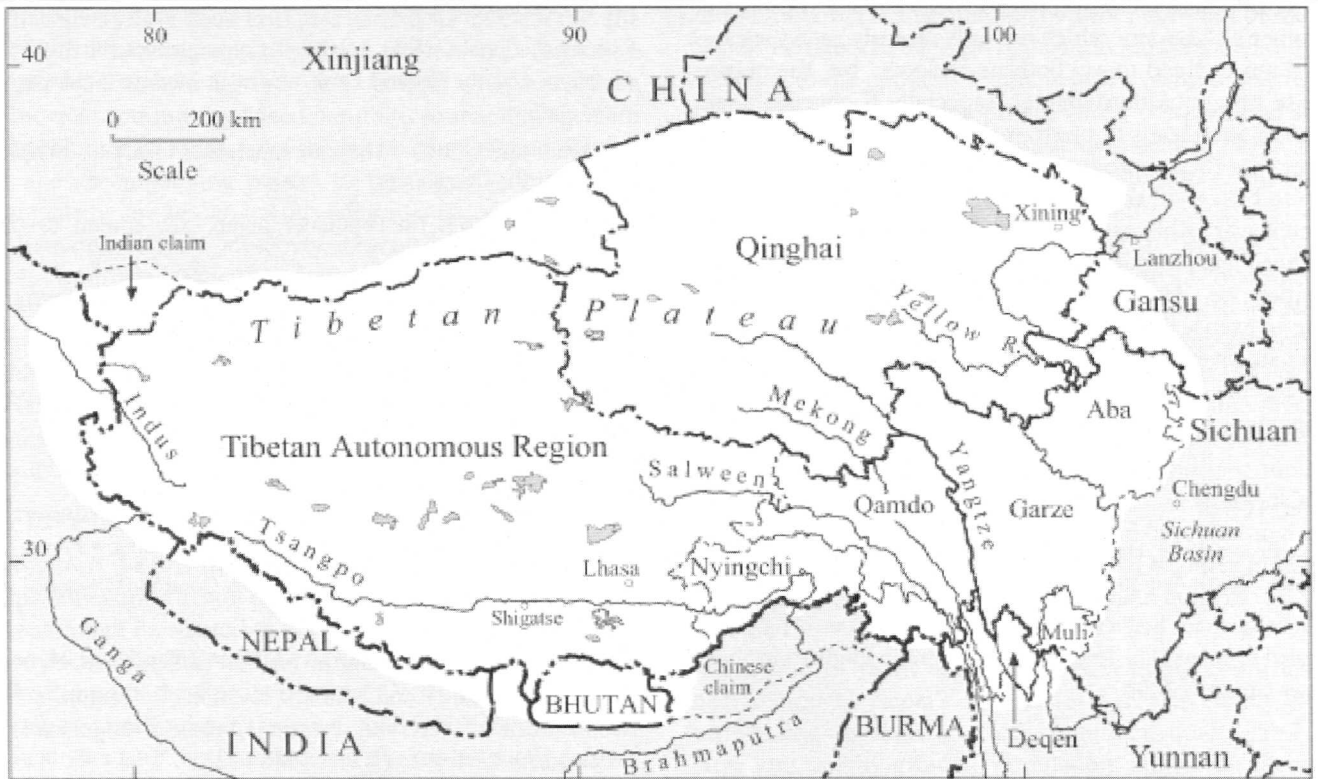
Map 1: Tibetan Plateau