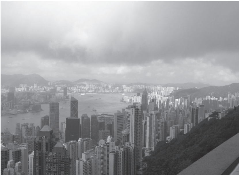
Illustration 5. An Overview of Hong Kong.