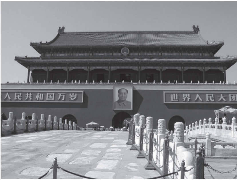
Illustration 2. Tiananmen and Chairman Mao.

If one examines the cities and the people a bit closer, however, one finds, in addition to more evidence of globalization, many local and distinctive signs. Inside Beijing city, for example, one finds the Forbidden City, Chairman Mao's mausoleum, hutong (alleys) with old Chinese houses that are now popular tourist sites, and the Panjiayuan Bazaar of Antiques, where native and foreign collectors can purchase all kinds of historical relics, mostly fake, for reasonable sums of money. Just outside Beijing city proper, one finds the Great Wall, the Ming Tombs, and the Chinese Minorities Park. Witnessing such Chinese signs mingled among many that are either Western, non-Chinese, or generic, one sees how the local, the global, the old, the new, the Chinese, and the non-Chinese operatively coexist in China. Thus, one asks how the diverse elements interact to forge globalized and postmodern realities in China. Since Chinese citizens appear to prosper, one has to presume that there is some sort of overarching logic or system in their operations, which bystanders may, nevertheless, find dissonant, if not schizophrenic. 11