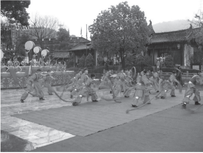
Illustration 8. A Drum and Ribbon Dance, Songcheng.

of more than a million people. It was where romantic scholar-officials and beautiful courtesans frolicked around the scenic West Lake—a history and a lifestyle that Chinese operas continuously glamorize and many Chinese individuals crave. 14 To help Chinese people get in touch with such a remembered and romanticized past, to promote tourism in Hangzhou, 15 and to make money for the investors, Songcheng was launched in 1995. It attracts visitors by offering a rich program of daily activities and musical shows, such as processions of dignitaries escorted with loud drum and wind music, and energetic performances of instrumental music and dances at the city gate by handsome young men and beautiful girls. Featuring catchy melodies and bouncing rhythms, the performances are created to entertain visitors and stimulate their imaginations about the cherished past of Southern Song China. Jaded world travelers and music audiences will probably find nothing artistic or significant in these anachronistic sights and sounds. Some would not hesitate to criticize them as bastardized sounds of global tourism. The reality is that Southern Song music as it was actually heard in the thirteenth century has vanished. Unless Chinese music practitioners mix fact with fiction, they cannot musically communicate