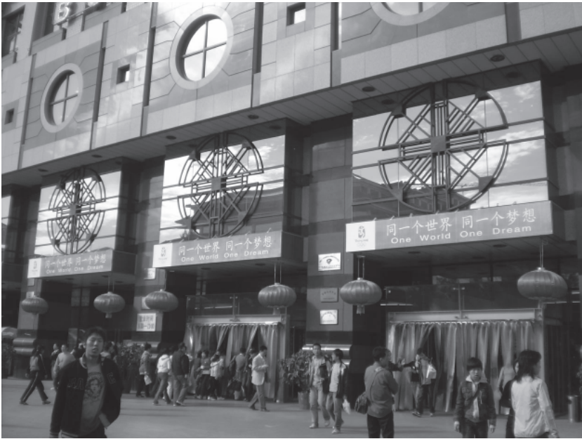
Illustration 3. A Multi-Storied Bookstore in Beijing.

ments, generating operative coherence and exercising Chinese agency. Witness the case of Hong Kong, where one finds not only the tallest (85 feet) outdoor bronze Buddha statue in the world, sitting atop a hill that is only miles away from Disneyland, but also rows and rows of skyscrapers all over the city. If the statue is propped by religious and traditional Chinese practices in the former British colony, the skyscrapers, in all kinds of shapes and styles, attest to a multitude of realities and dreams, all of which are intricately linked. For instance, some imposing buildings in Central, one of the top financial districts in the world, architecturally signify forces and memories that dominate the minds and actions of Hong Kong residents. The sharp silhouette of the China Bank, designed by I.M. Pei, cuts like a dagger, symbolizing perhaps the cutting-edge post-modernity of the new socialist-capitalist China, which welcomed Hong Kong back into her political embrace in 1997. China is now a critical force driving the Hong Kong financial engine. The avant-garde HSBC Group building, which stands close by, features a ground floor with no walls and an open space marked by a pair of bronze lions in “Western” poses. The building projects the proud history of the past while exuding present confidence for the future.