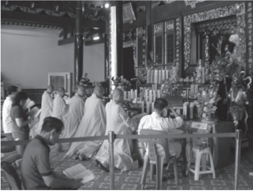
Illustration 11. Buddhist Chanting at Thian Hock Keng, Singapore.

May 9, 2007 celebrated the birthday of Mazu, the Chinese Goddess of the Sea, worshipped by numerous Chinese, especially those who live along coastal China and those who have emigrated to Southeast Asia and North America. The Buddhist and Daoist chanting performed in the temple during the four-day celebration (May 6–9, 2007) sharply contrasted with the contemporary and globalized sounds I heard elsewhere in Singapore. For example, one round of Buddhist chanting by a group of five monks and a small congregation was accompanied by only the tinkling of a bell and the striking of a wooden fish ( muyu ); the rhythmic and monotonous song of repentance had no easily identifiable traces of globalization or hybridity. 43