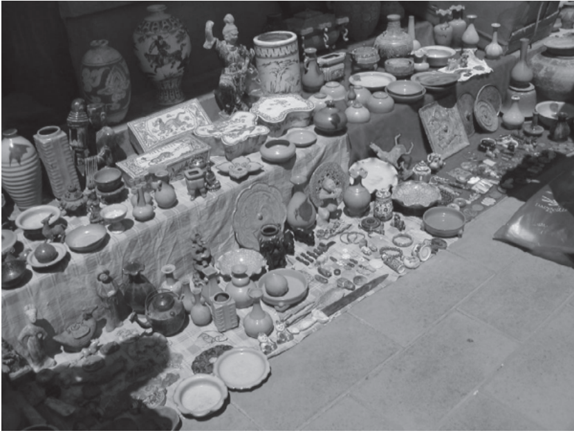
Illustration 4. Panjiayuan Antique Bazaar, Beijing.