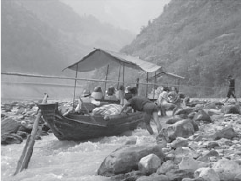
Illustration 1. Going Upstream on the Shennongxi.

scendental, and transformative agent of Chinese actions and imaginations that is simultaneously a force and a result of the process. 7 It is with references to this self that Chinese people claim musics of contrasting and conflicting forms and contents as their own, generating a dynamic music culture that revealingly and simultaneously operates with a multitude of indigenous and adopted musical theories, practices, and repertoires, each of which embodies individualized temporalities, sites, memories, and imaginations.