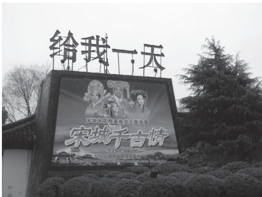
Illustration 7. Entrance Sign, Songcheng, Hangzhou.

notes that many tourist sites in China, especially those built as theme parks or entertainment centers, are manufactured to satisfy native dreams and needs. Songcheng (Song City) in Hangzhou, for example, provides a fascinating case, demonstrating how the global and the local have joined forces to stimulate memories about a particular historical time and place in China, namely, Lin'an, the capital of Southern Song China (1127–1279), at a critical stage in Chinese history. 13 Hangzhou is where Lin'an once stood. Built as a miniature of the historical city, complete with streets, temples, shops, restaurants, and homes, the theme park sells historical imaginations and entertainment with a catchy slogan: " Geiwo yitian, huan ni qiannian. " Literally, it says, "Give me one day, and I will return to you a thousand years"—the promise of reaping huge profits with a minuscule investment underscores current Chinese dreams of getting rich effortlessly and overnight. In less emotive language, what the slogan claims is: "If you come to visit this theme park for one day, you will leave with memories about the Southern Song dynasty of a thousand years ago."