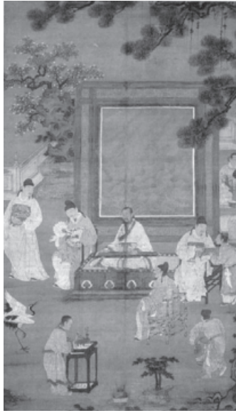
Illustration 10. An Elite Qin Party in Ming China; An Excerpt from Du Jin's (active ca. 1465–1509) "Eighteen Scholars."

rent performance or recordings, so that they can better appeal to the globalized audiences who listen to recorded qin music in the comfort of their homes while seeking temporary relief from their fast and mundane lives by engaging with an idealized and artistic past. Most qin performance have been sanitized. Historical modes, tonal dissonances, and "white noise" produced by the performers' fingernails scraping silk strings, for example, have all become undesirable sounds and have been promptly erased. The civilized and expressive Chinese self of the present is obviously not a mechanical copy of earlier editions. Even if contemporary Chinese elite share much with their ancestors, they are civilized and expressive in their own current and globalized ways.