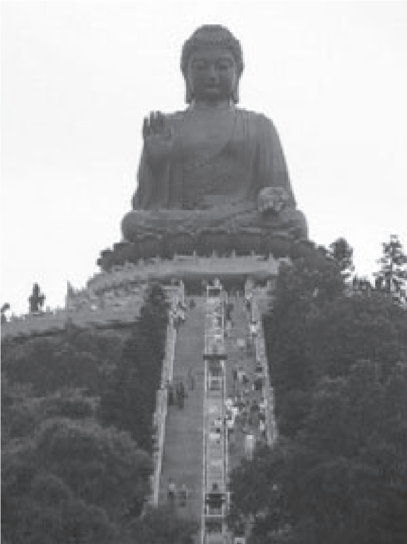
Illustration 6. Bronze Buddha in Lantau Island, Hong Kong. 12

HSBC Group grew out of the Hong Kong Shanghai Banking Corporation Limited, a British financial firm that was first launched in colonial Hong Kong in 1865. It then developed in semi-colonial and early 20th-century Shanghai and subsequently matured in the internationalized Hong Kong of the mid- and late 20th century. Currently headquartered