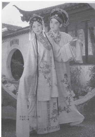
Illustration 16. A Publicity Photo of the Peony Pavilion , The Young Lovers' Edition . 60

and bawdy” Chinese self reflected in Chen’s theatrical presentation. To counter Chen’s offense, the Chinese government had the Shanghai Kunqu Company launch a new production, one that presented a more “authentic” image of the Chinese self. Artistic as it is, the Shanghai production has not attracted international attention; it was performed only inside China and in Hong Kong.