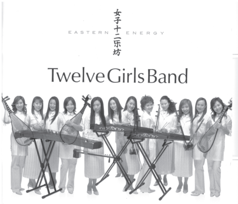
Illustration 15. The Twelve Girls Band.

in point is the international success of the Twelve Girls Band. Featuring a bevy of young and beautiful Chinese women musicians playing a mixed repertoire of Chinese and Western tunes with traditional Chinese musical instruments, the band's music and performances can only be described as Chinese, globalized, and popularized. Launched in Beijing in 2001 and marketed worldwide with Japanese help, the band has attracted many audiences inside and outside China. 54 It has also provoked a lot of criticism among Chinese audiences and critics, just as gendered and sensuous Chinese music did in imperial and Confucian China. Many Chinese critics find the girls' blend of Chinese, Western, and world musics—as demonstrated by the performance of the tune " Liu Sanjie " (Sister Three of the Liu Family)—superficial and dubious. Many have objected to the sexist marketing of their music and performance. The moral underpinning of the discourse is a Confucian ideology and practice: music should be used to cultivate virtues, not corrupt people's aspirations (especially men's); sexy women performing vulgar