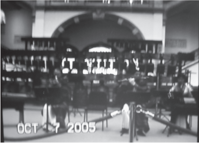
Illustration 9. A Performance of Bell-Chime Music at the Tropical Museum, Amsterdam.

Chinese operatic stages. The deep sounds of the big bells echoed in the large and domed hall, generating sonic confrontations between ancient and modern Chinese pitches, and between Chinese musical instruments and European edifice.