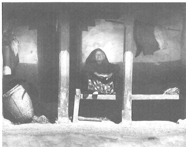
Limbu Woman on Charpoy

By looking back to 1984, and tracing the subsequent development of political consciousness in this area, we can see how Maoist ideological arguments, particularly in their early incarnations, made a certain amount of pragmatic sense to many of Piskar's inhabitants. Once this history is acknowledged, participation in the Maoist movement for some of those involved may be understood as a logical reaction to earlier experiences of state violence and oppression rather than as an anomalous break precipitated by outside forces beyond their comprehension or control. Understanding this manner of motivation in greater depth requires tracing the historical trajectories of frustration, rage, and resistance as they are refracted through memory to become relevant categories in our analysis of the contemporary situation. As the Piskar example shows, the Maoist movement may have been in part a