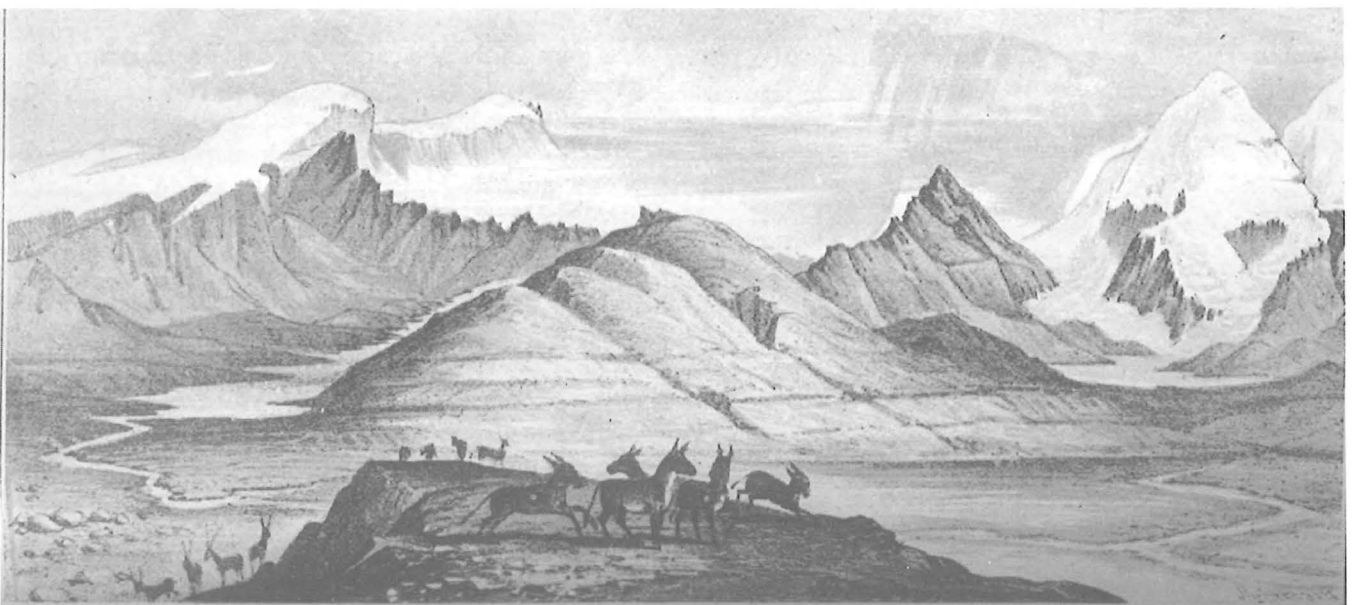
Colomoo Lake and Lachen River from Bomtso