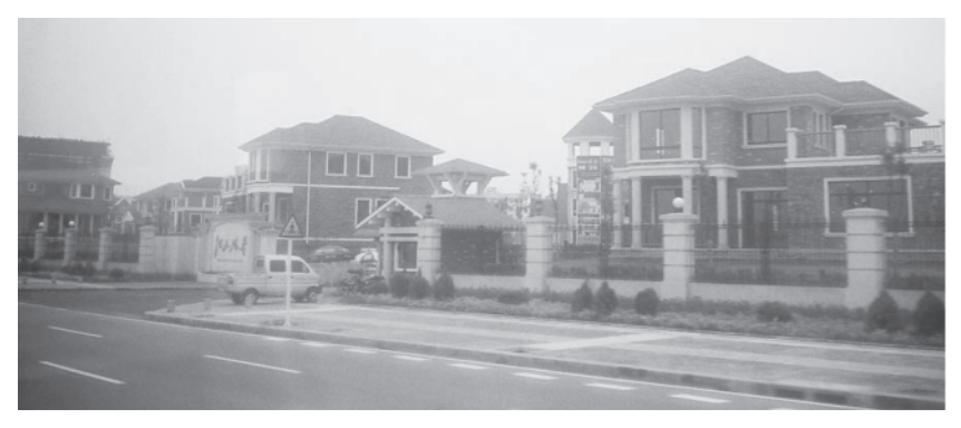
Figure 1: Suburban Housing on the Outskirts of Yichang.

entrance, oriented toward entry via vehicle, were gated with guards. The only businesses located in the area included a small open-air market, a few real-estate offices, and restaurants. Many empty storefronts undoubtedly awaited new occupants.