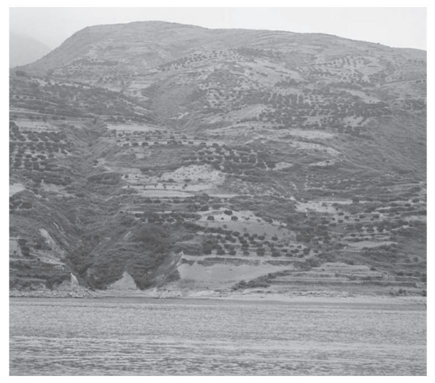
Figure 2: Cultivation along the Yangtze with the Three River Gorges reservoir.

and land control while the small businesses emerging amidst the ruins and the perpetuation of raising crops are indicative of local scale resistance to these changes.