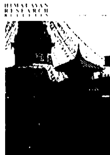
Nepal After the Revolution

Formerly published as HIMALAYAN RESEARCH BULLETIN (1981-2003) and the Nepal Studies Association Newsletter (1972-1980) by the Association for Nepal and Himalayan Studies—formerly the Nepal Studies Association (1972-2000).