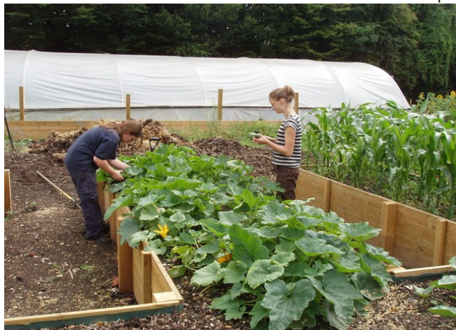
“Raised vegetable beds for disabled access” 2009 David Hawgood

requirements can exclude youth with some kinds of disabilities, especially youth who require mobility aids. Creating accessible farms is certainly a challenge, but it is not impossible. The urban farm is a great opportunity for this. While suburban farms are usually built on pre-existing farmland, urban farms are conversions of the urban landscape.