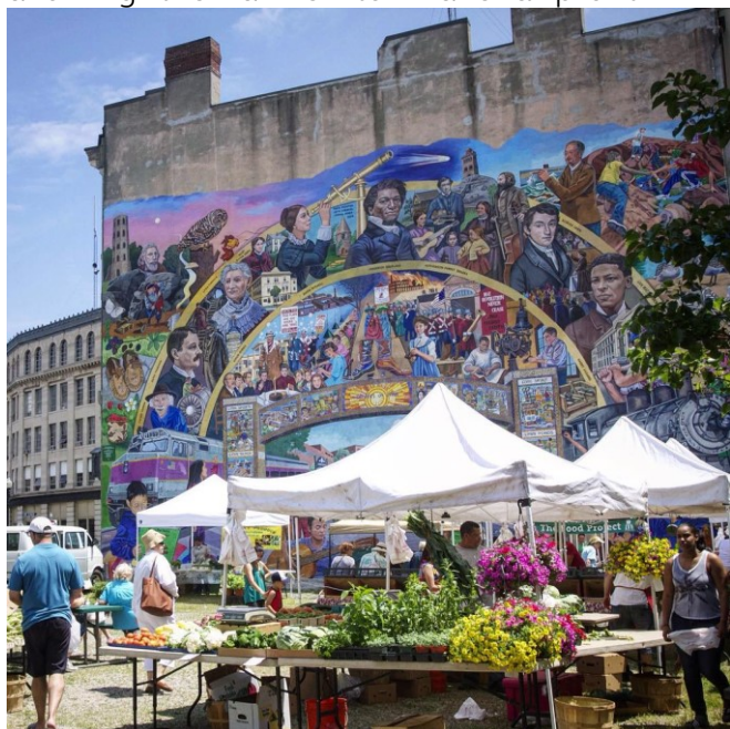
Lynn Farmer's Market in Central Square

According to Jennings et al., true empowerment happens when youth are able to address structures and practices themselves. Building raised beds may create sociopolitical change, but the youth are not the ones who created the BAG program, even if they are the ones who construct the gardens themselves. Sean argues that The Food Project is doing that empowerment: