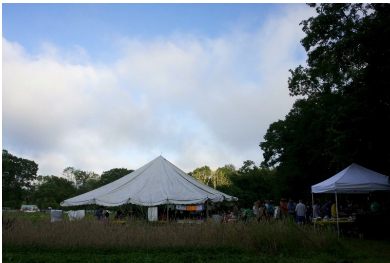
Tent on the Wenham Land

It's a cloudy, almost rainy day and I'm 15 years old. I file off a bus with 29 other people who I've never met. We're in the suburban, almost rural town of Ipswich, Massachusetts. Most of us shuffle over and sit under a large, almost circus-like tent set up to the side of a 3 acre farm. We are greeted with relentless enthusiasm by the program staff. It's my first job, but today doesn't feel like I'm going to work. I get put into a team called a "crew", who apparently I'll be working with for the rest of the summer. I am quiet and nervous; everything is new and strange and I don't know what to make of any of it. But hey, at least I'll be getting paid?