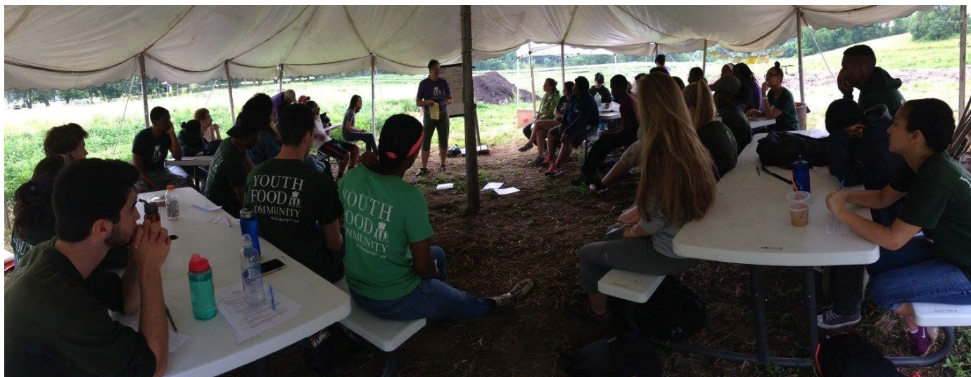
North Shore Root Crew participating in a workshop

varied opportunities for youth to engage in and practice leadership skills. These youth did not find their empowerment or the meaning of the work in the same spaces but nonetheless they found it.