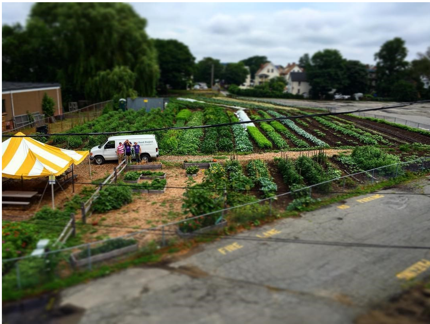
Farmland behind Ingalls Elementary School

been used to evaluate current youth development programs such as in Melissa Pearrow's study, "A Critical Examination of an Urban-Based Youth Empowerment Strategy." 19 Pearrow's evaluation is that the organization she studied, the Teen Empowerment Program, does meet these dimensions however she suggests that "there needs to be more systematic examination of how this program impacts the individual and collective sense of empowerment." 20 Review and evaluation of youth empowerment programs needs to happen. Yet, not all scholars agree with what constitutes solid evidence. Pearrow aligns more with Jennings