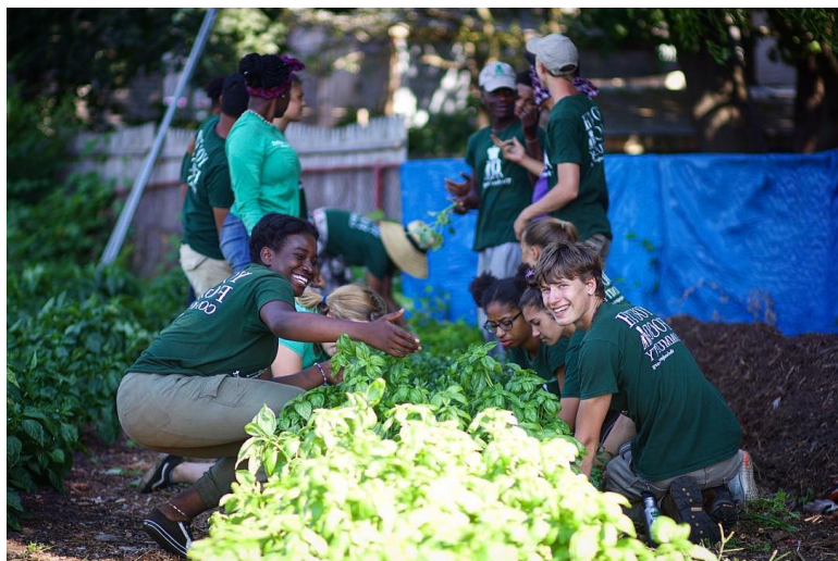
Youth Crew on the Ingalls Land

A few weeks in and today my crew is out amongst the basil, weeding and pruning the plants. The weeding is easy; I run my hands through the soil, shifting it around and aerating it, all while dislodging weeds. The rain causes the soil to stick to my hands, coating them in mud. I look up and one of my crewmates is exclaiming in alarm. The muddy soil has turned treacherous and she has sunk into the path between the farm beds. The crew rushes over to help and we get her out, only... her shoes are left behind in the mud! We grab them and head to the relative safety of the tent. We are wet and muddy, but I can't help but feel closer to these strangers who make up my crew