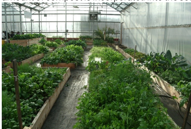
The Food Project's greenhouse located in Dorchester, MA

In fact, within The Food Project's structure there are separate Urban Growers and Suburban Growers. This is not a question of acreage, it is a matter of technique. Though both work to practice sustainable agriculture, what that looks like on 1 acre out of 31 suburban acres and 1 acre out of 1 total urban acre, is very different. In the urban context, soil contamination is common. Lead from gas and paint has seeped into the soil over the years so it is unsafe to plant directly in that soil. Instead, an urban farm is more likely to put down landscaping fabric (a permeable fabric designed to maintain soil moisture and drainage) in order to create a barrier and then trucked in all fresh soil and compost. A raised bed on an urban farm could even be 100% compost, whereas on a suburban farm a small amount of compost is incorporated into the soil