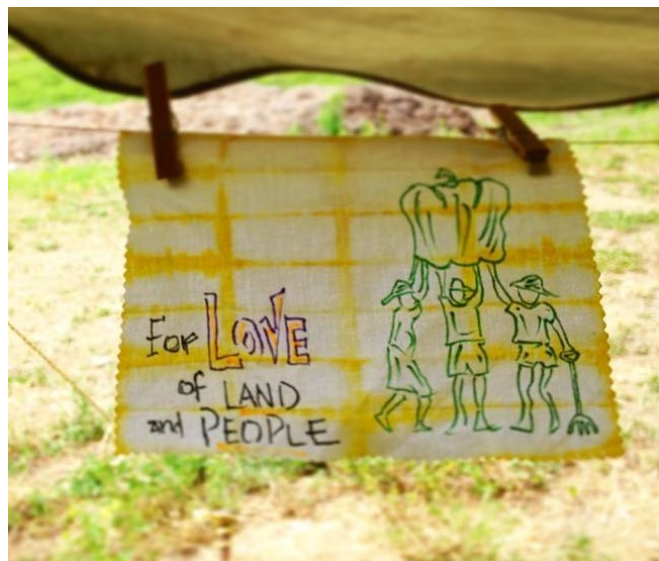
For Love of Land and People

the cost of inattention or a lack of effort; the weeds come back or the plant becomes overgrown. It is similarly easy to see (and eat!) the literal fruits of your labor. In a very visceral way, your work matters. The Food Project meant to bring youth together to do meaningful work that would make a difference, "Meaningful action and lasting changes come through love and respect for land and for people," Ward Chaney wrote. From this aim, The Food Project became the practice of "Youth Growing Together;" 9 both youth working alongside one another to grow produce, and youth building relationships with one another across lines of difference.