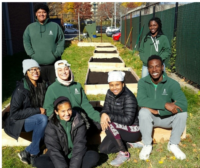
North Shore Dirt Crew with the Build A Garden beds they built

Garden program (BAG) that Elisa references has built over a thousand raised bed gardens in Boston and on the North Shore between 2009 and 2014. 48 That is at least one thousand families with the ability to grow their own food. The youth who constructed those beds directly contribute to the food sovereignty of one thousand families. The Food Project enables youth to enact change in sociopolitical processes when it puts them at the forefront of these efforts.