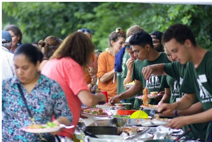
North Shore Family Feast

Today is the last day of my summer job and it is our Family Feast celebration. I'm surrounded by all of these people I've gotten to know this summer and a bunch of our family and friends. My crew is going to perform a skit about what we've learned about sustainable agriculture this summer, but really I'm just excited to get to dig into the food! It is fun and bittersweet. Goodbyes take several minutes as everyone tries to hug everyone else. This summer has been even more than I imagined it could be, I hope I can return again!