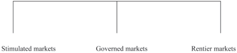
Figure 1. Regulated Economies

ing and maintaining infrastructure, insuring the validity of contracts, and keeping law and order. 53