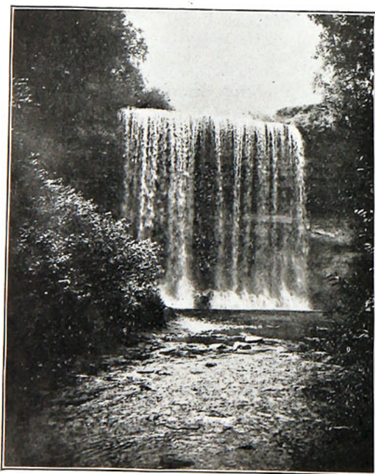
MINNEHAHA FALLS—A SHORT DISTANCE FROM COLLEGE.

Text books: Houston's Physical Geography, Martin's Human Body (briefer course), Carhart and Chute's Elementary Physics, Boyer's Biology.