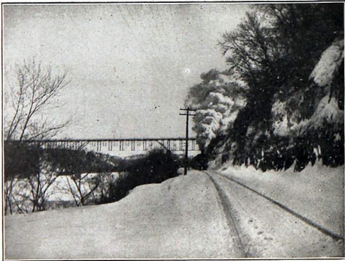
VIEW NEAR FORT SNELLING.

And such, in general, is the aim of the founders and of the Board of Macalester College.