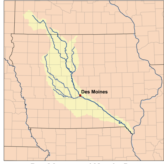
Des Moines and Nearby Rivers

building of Fort Des Moines (Pratt, 1972). The fort was abandoned three years later, but settlers continued to move into the area and in 1846 it was made the seat of Polk County. The first major flood in Des Moines came in May of 1851, which wiped away much of the early town. The same year as the flood Des Moines was formally incorporated as a city and made the capital