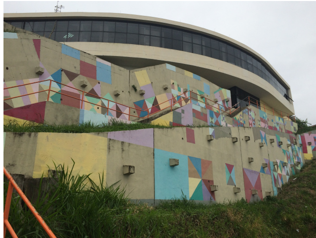
Figure 2.4. MACquinho, Morro do Palácio, Niterói – designed by Oscar Niemeyer

community, many residents don't participate in MACquinho programming, and its staff are investigating as to why. One reason hypothesized by a staff member is that the building seems to have "its back turned" on the community; the building looks outward towards the bay with no windows on the community side. Despite this relative lack of participation, community organizations such as the MACquinho are instrumental in developing insurgent forms of citizenship and community pride; a key step in promoting a positive community identity.