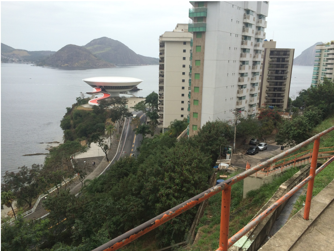
Figure 2.2. View from the MACquinho towards the MAC (also designed by Niemeyer) and the Baía da Guanabara, Niterói.