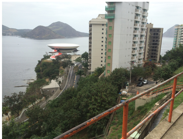
Figure 2.5. View from the MACquinho towards the MAC (also designed by Niemeyer) and the Baía da Guanabara, Niterói.

In addition to the work of the MACquinho, students and professors from the Universidade Federal Fluminense (UFF), the local university located a few streets away from the