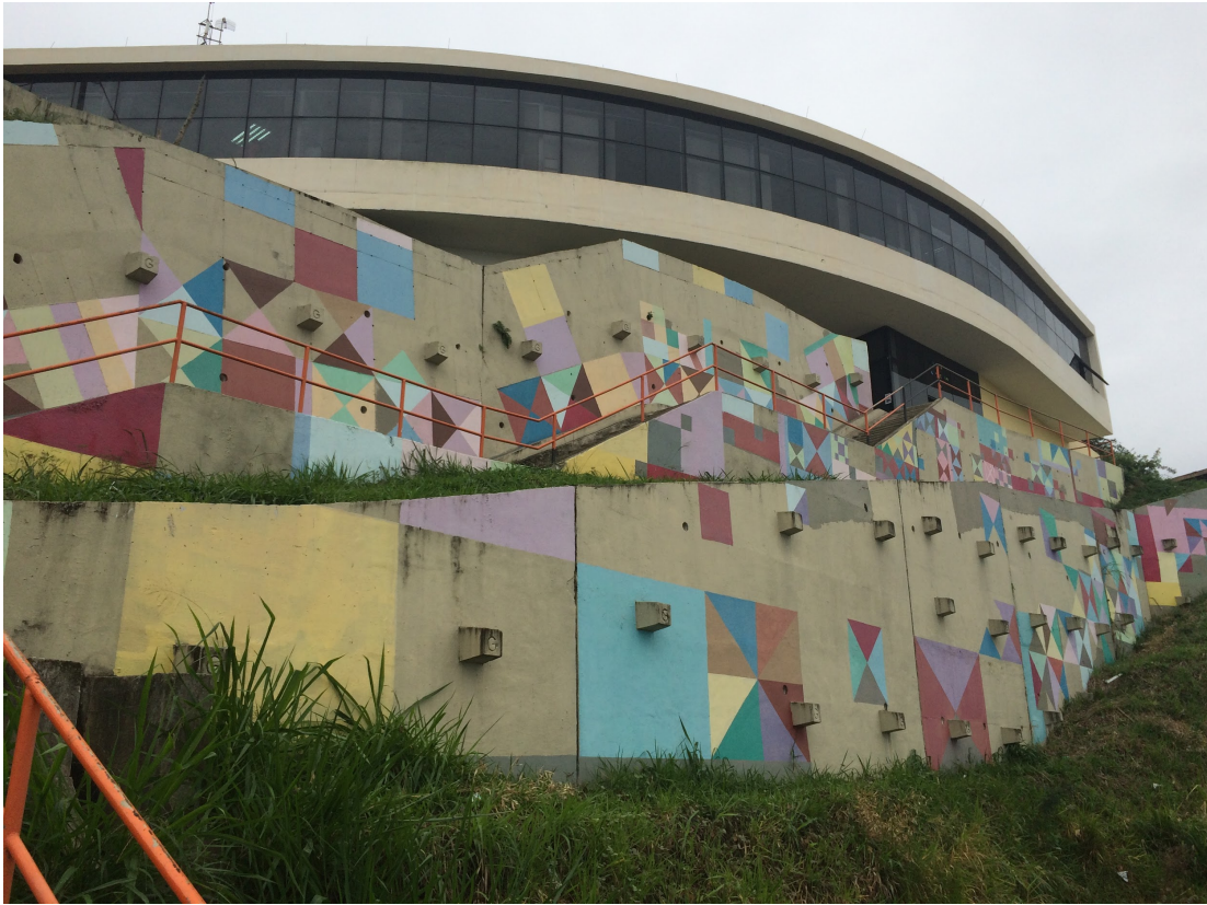
Figure 2.1. MACquinho, Morro do Palácio, Niterói – designed by Oscar Niemeyer.