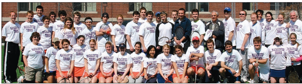
Left: Alumni Tennis Event