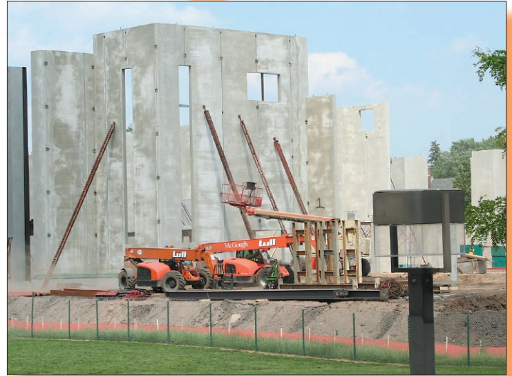
The Macalester Athletic and Recreation Center (MARC) rose from the ground as the first of 347 pre-cast concrete panels were set into place at the end of May. The concrete in the panels would be enough to make a three-foot-wide sidewalk 14 miles long.