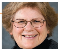
ATHLETIC NEWS P. 2