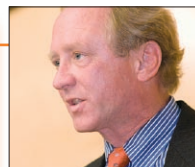
PRESIDENT'S MESSAGE P. 3