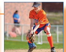
SPRING SPORT HIGHLIGHTS P. 7