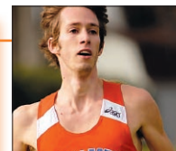
ATHLETES RECOGNIZED P. 4