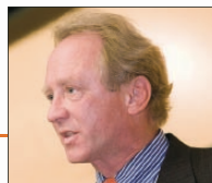
PRESIDENT'S MESSAGE P. 2