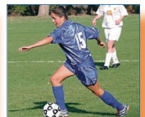
FALL OUTLOOK P. 6