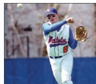
SPRING SPORTS RECAP P. 4