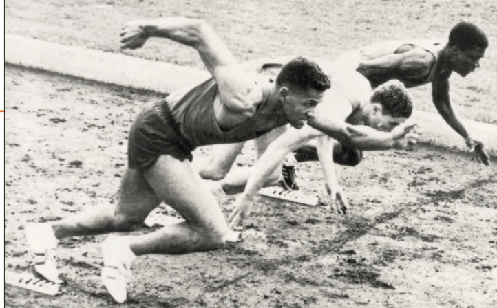
Record-setting runner Kofi Annan '61 (far right).

This award is conferred annually on the swimming or diving coach in high school, club or university ranks, who, in the opinion of the