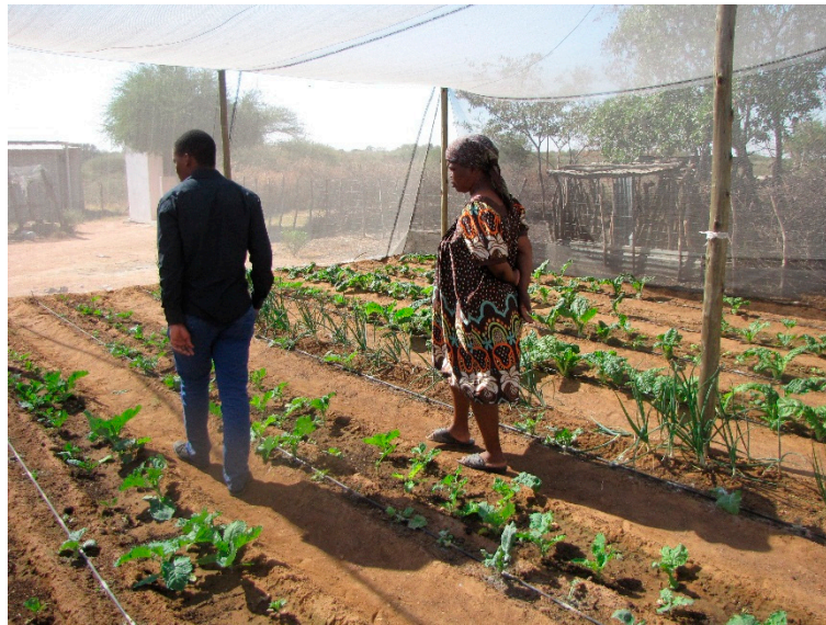
Figure 3. The backyard gardening initiative in Botswana.

Today Botswana imports 90 percent of its food overall, and crop agriculture (not to be confused with livestock rearing) is in a more marginal position than ever in the country's political economy. Despite this fragility and marginality, crop agriculture still remains an important activity for the poor and women. Small farmers (defined as those who cultivate 20 hectares or less) work 80 percent of planted area and produce 38 percent of the harvest. Agriculture employs 30 percent of the total workforce and 35 percent of women [47].