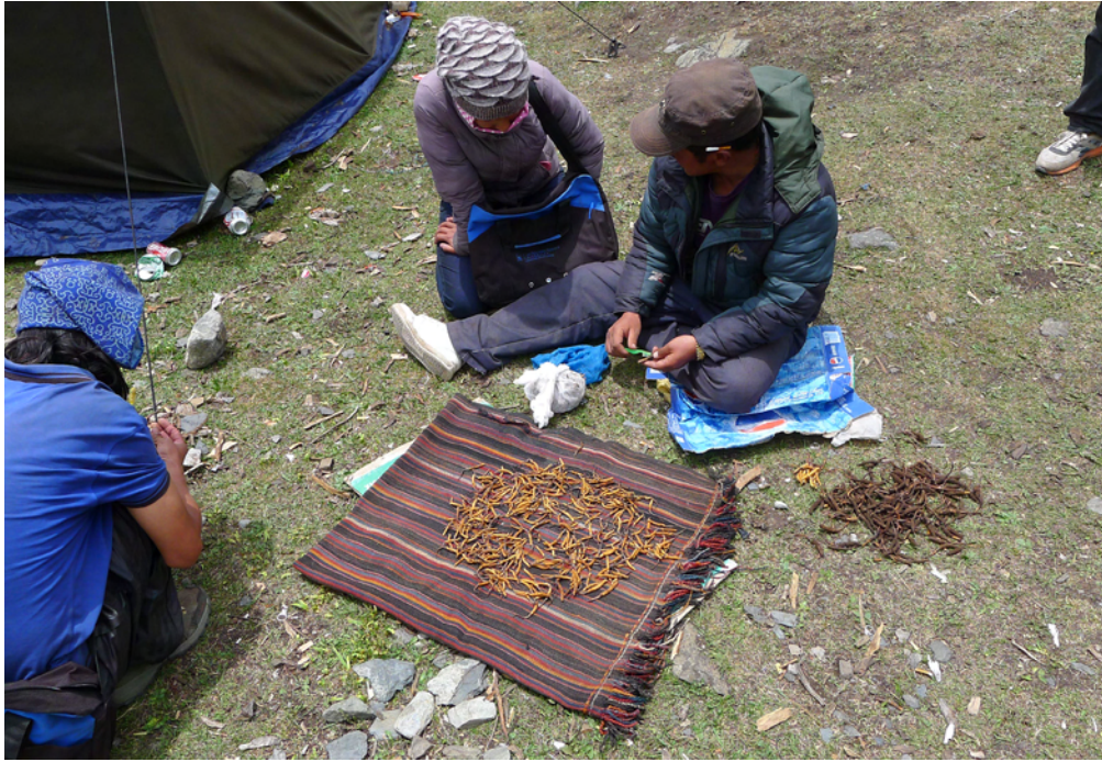
Figure 3. Cleaning yartsa gunbu prior to sale, Tsum.