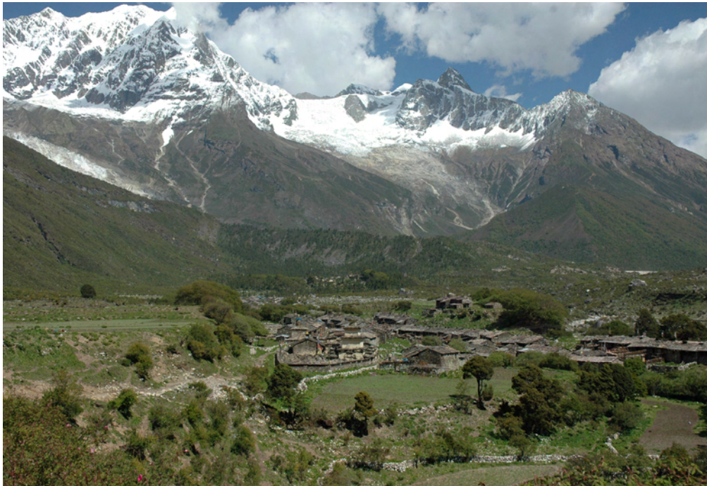
Figure 4. Sama Village, Nubri.