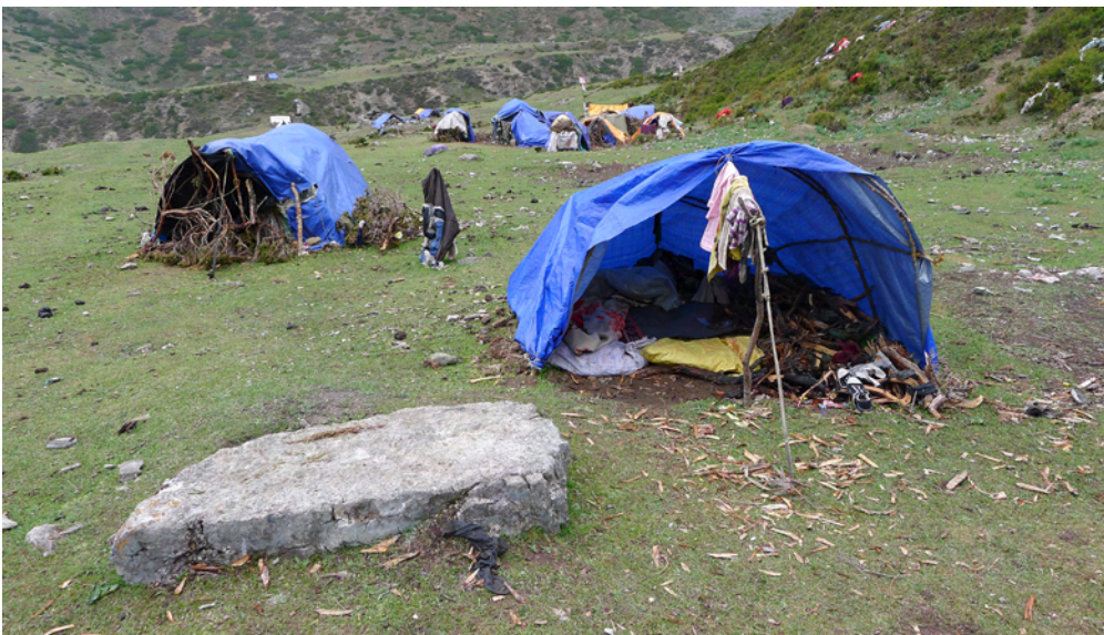
Figure 2. Yartsa gunbu collectors' shelter, Tsum.

Traditionally, Tsum's residents were reluctant to gather yartsa gunbu on the grounds that doing so constituted the killing of a living being. According to a local saying, "Digging up one worm is equivalent to killing one fully ordained monk." 6 Nowadays, however, 83% of household