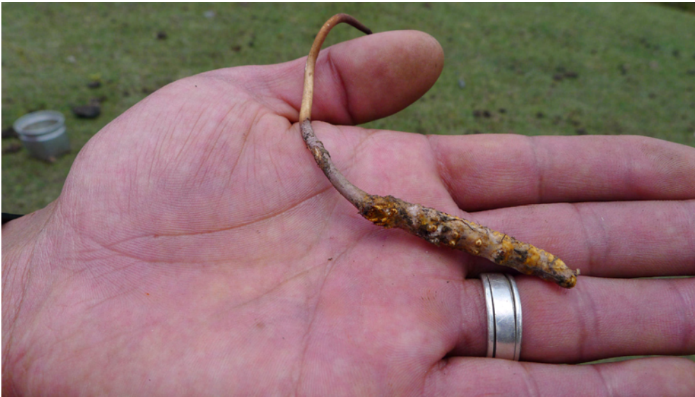
Figure 5. Yartsa gunbu is the best source of income today in Nubri and Tsum.