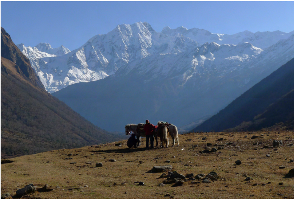
Figure 6. Horsemen between Sama and Samdo, Nubri.