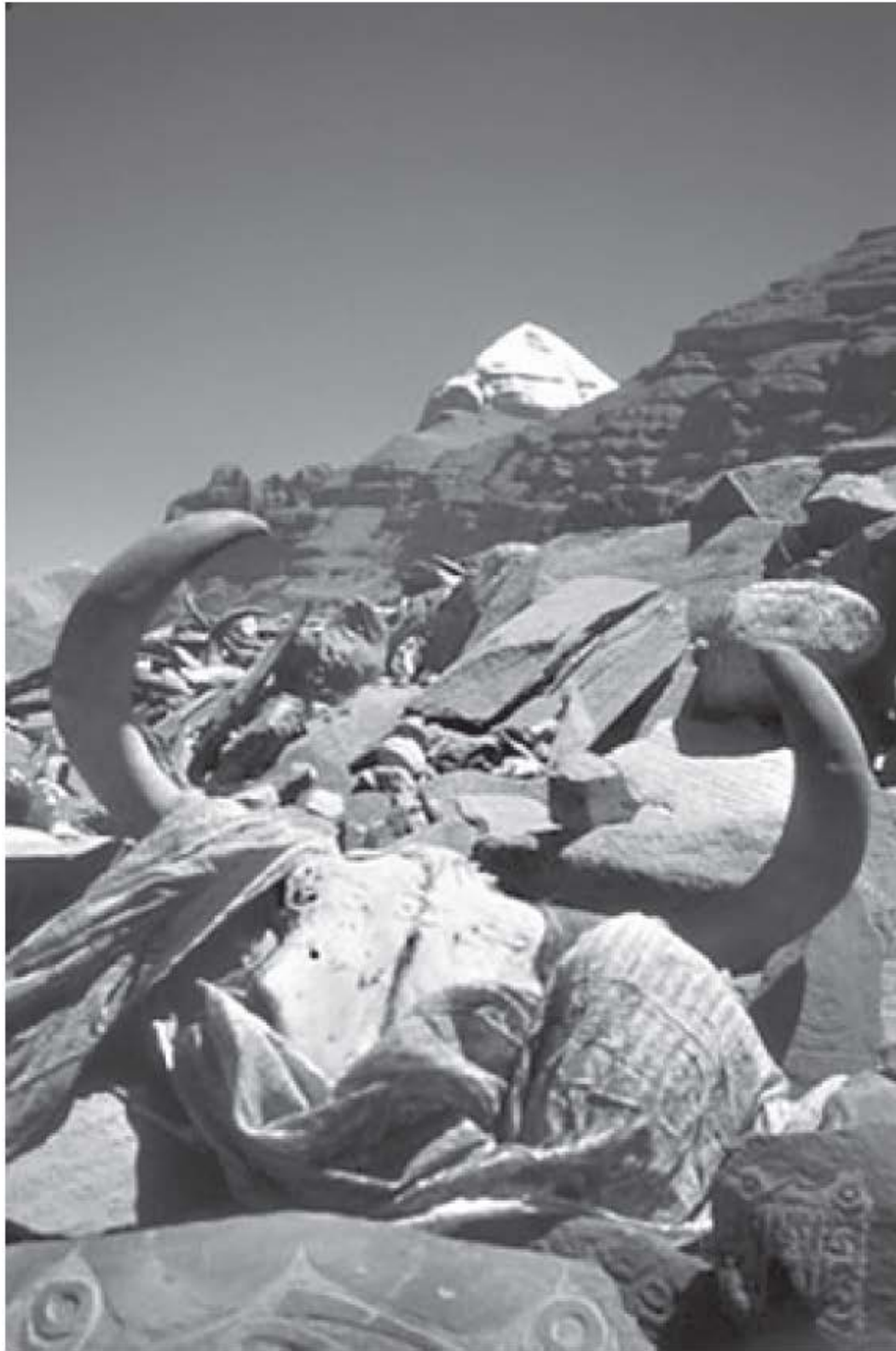
Yak skull and prayer flags on pilgrimage route around Mr. Kailash