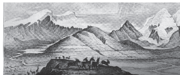
From Himalayan Journals