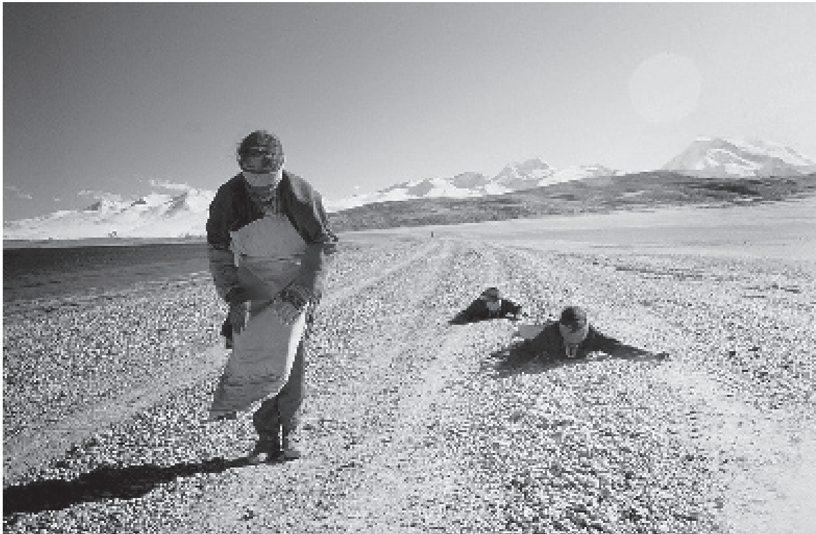
Chaktsal around Tso Mapham