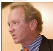
PRESIDENT'S MESSAGE P. 3