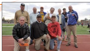
TRACK TEAM 50-YEAR REUNION P. 3