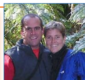
SCOT JOINS BOARD OF TRUSTEES P. 4