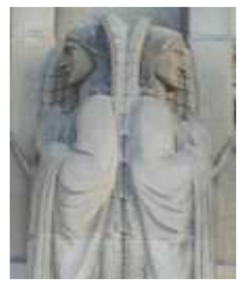
Church of the Heavenly Rest, New York