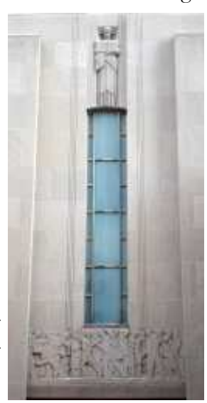
Above the Fourth St. entrance.

There are important differences between the panels too. The Nebraska frieze is full of local references—plants, animals, tools, and Buffalo Bill. The St. Paul scene has no local anchor; it could be a street in just about any city in the Americas or Europe.