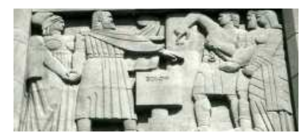
Solon, Nebraska Capitol

Lee Lawrie had the good fortune to possess that artistic temperament that thrives within narrow limits, like Shakespeare's poetry within the