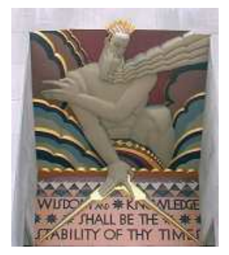
Wisdom, Rockefeller Center

We offer here just a sampling of Lawrie's work, designed to give the reader a sense of his productivity and range of styles. No one has yet compiled a complete list of his creations, and that is beyond the scope of this article. It will suffice here to mention some of his noteworthy commissions.