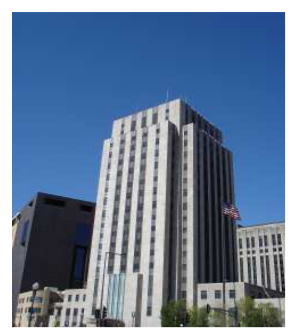
Ramsey County Courthouse and St. Paul City Hall.

One can see what Goodhue and Lawrie were up to. The historical scenes are relentlessly horizontal and earthbound, like Nebraska. The background events are static, but Nebraska itself, expressed in "The Pioneers," is in motion, dynamic, alive. Above all, atop the central tower, stands "The Sower," the symbol of agriculture and by extension civilization, his scattered seeds giving rise to life, community, prosperity. This is Goodhue's and Lawrie's combined masterpiece, architecture and sculpture united.<sup>4</sup>