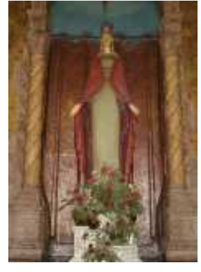
Mary, Church of St. Mary the Virgin, New York.