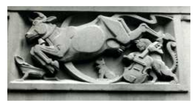
Los Angeles Public Library, photo from Sculpture , by Lee Lawrie.

A Lee Lawrie tour of the United States would cover a lot of ground: Providence, Rhode Island; West Point, Brooklyn, and Manhattan in New York; Philadelphia; Washington, D.C.; Florida; Louisiana; Pittsburgh, Pennsylvania; South Bend, Indiana; Chicago; Lincoln, Nebraska; St. Paul, and on to California.