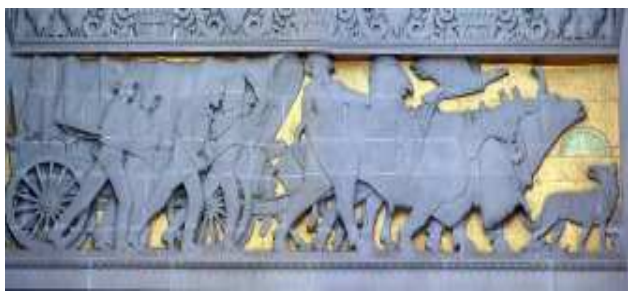
"The People," top, and "The Pioneers."

The two show the same sense of movement, though the urban scene is more crowded and hec-