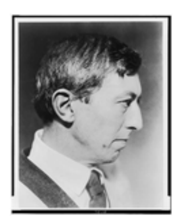
Lee Lawrie, Library of Congress photo.

The invention of the skyscraper presented ar-