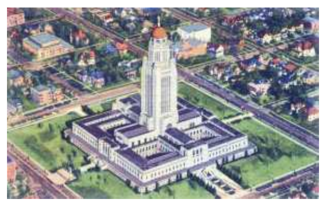
Nebraska Capitol. Postcard courtesy of Gregory Harm.

Throughout history sculpture had been placed where the unaided eye could (more or less) comfortably appreciate it. But, what place could outdoor sculpture have on a building three hundred feet tall?